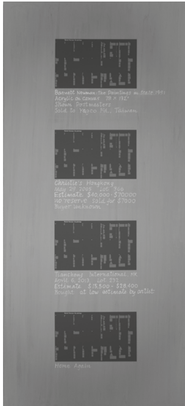
Home Again , 2013, acrylique et huile sur toile, 74,3 x 127 cm acrylic and oil on canvas, 108 x 50 inches