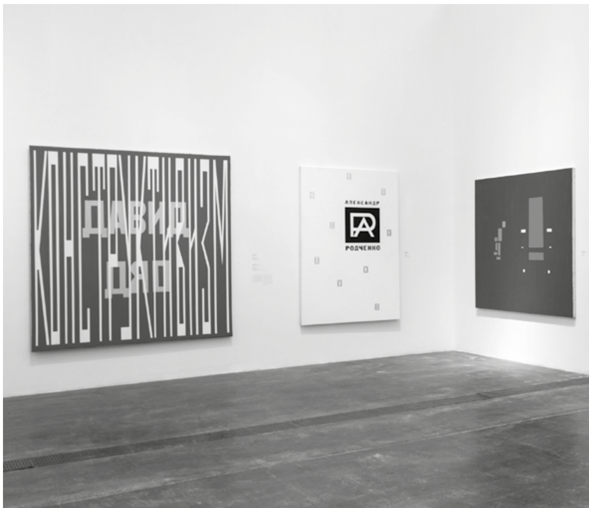
Vue d'installation, « David Diao », UCCA Pekin, 2015 Installation view of « David Diao » at UCCA Beijing, 2015