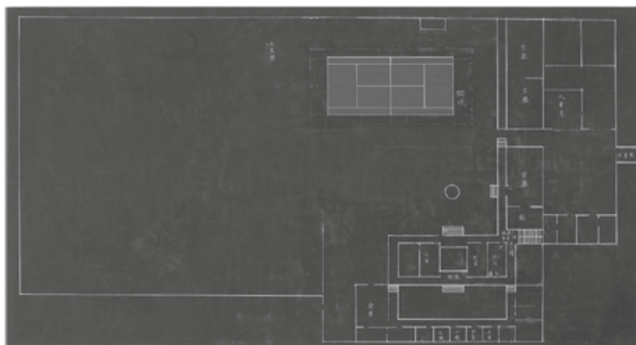
From My Memory , 2008, acrylique et crayon sur toile, 107 x 198 cm acrylic and crayon on canvas, 42 x 78 inches